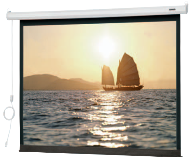
Matte White and High Power® fabrics will be seamless in all sizes.